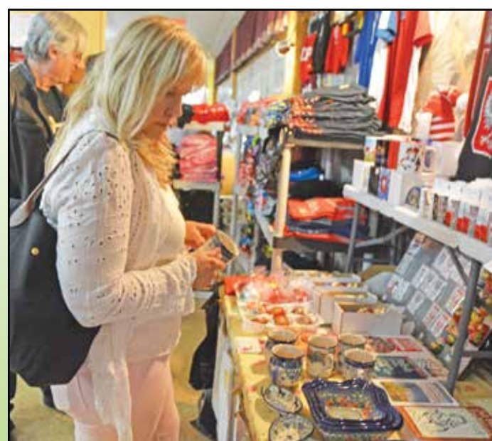
St. Florian's annual Strawberry Festival is right around the corner, coming May 2-3. The event features home-cooked Polish dinners and live bands.