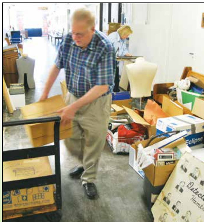
The Hamtramck Historical Museum has had another busy month with visitors.

The museum held its Annual Board Retreat recently, where they dealt with a laundry list