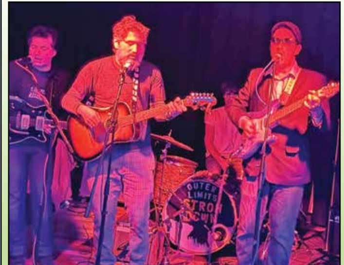
Music will be in the air this weekend with the return of the Hamtramck Blowout that includes performances in over a dozen local venues.