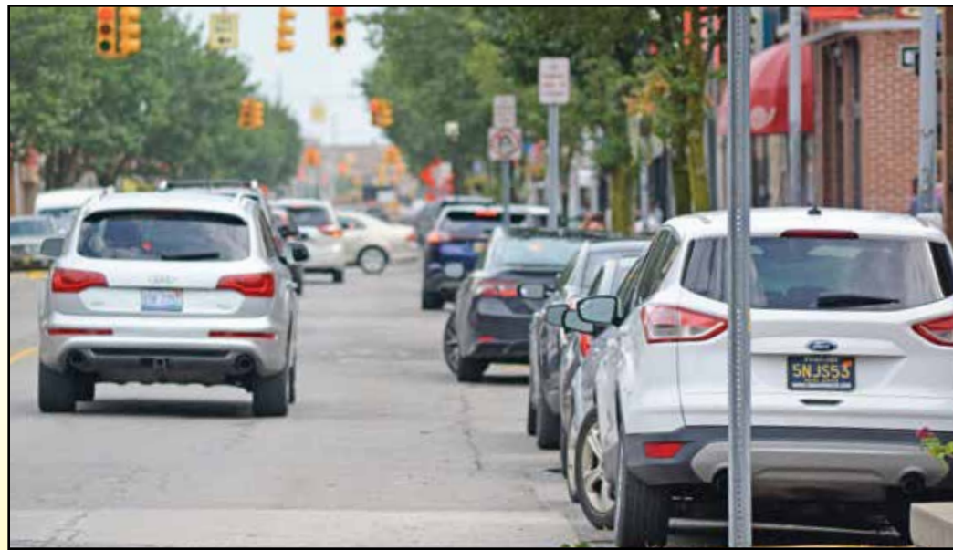
The state is now offering a helping hand to boost Hamtramck's main business district on Jos. Campau, and it will commit to assisting the city for five years in developing the district.

"Hamtramck is a place known for giving newcomers to Michigan and the