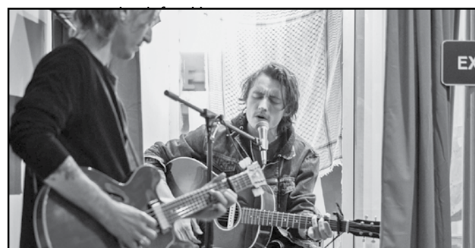
The Hamtramck Blowout returns next week, featuring dozens of bands playing in various clubs and performance spaces in Hamtramck.

• Available at participating venues, such as: • Detroit Threads: 10238 Jos. Campau Ave., after 2 p.m. on Fridays and Saturdays • Call ahead to ensure availability Wristband Pick-up for On-