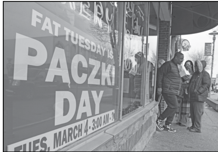
Paczki Day was once again celebrated in the city's bakeries and bars.

That demand came from President Trump through an executive order. Trump's administration has been rooting out DEI programs in the federal government, in the belief that DEI promotes less qualified people to