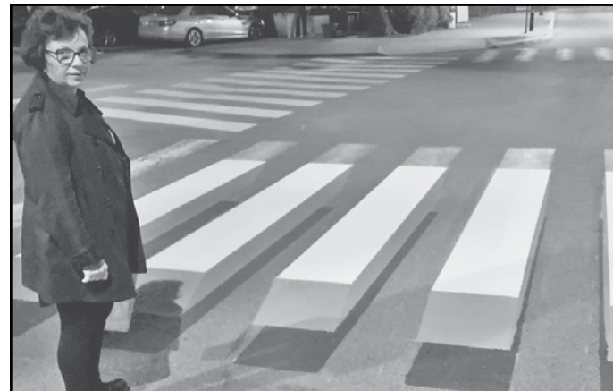
For a moment, some in the city considered incorporating a three-dimensional pedestrian crosswalk that a number of cities in Europe use.

Charges against Sadman were eventually dropped when two witnesses failed to appear in court to testify. They could be reinstated at a future date.