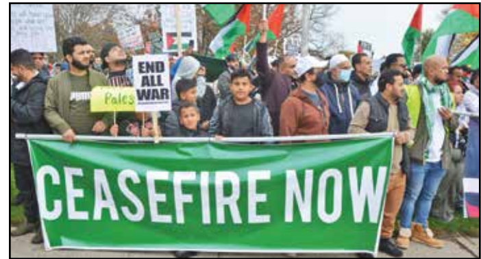
Two years ago over a thousand people took to the city's streets to protest the Biden administration's policy of supporting Israel in its war on Gaza. Flash forward to today, and no one is protesting President Trump for his continued support of Israel.

And, for those wondering, they all flew eco-