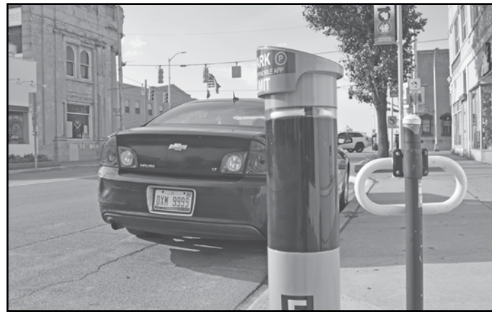
The city council decided to get rid of the parking meters on Jos. Campau after numerous complaints were made by residents and merchants.

how the meters chased business customers away because they were hard to use, or that the app didn't work, or that they were not providing enough time for people to get out of their vehicles and actively feed the meter.