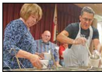
The St. Florian Parish recently held a soup festival in a celebration of fall.

Ah yes, the sound of satisfied customers!