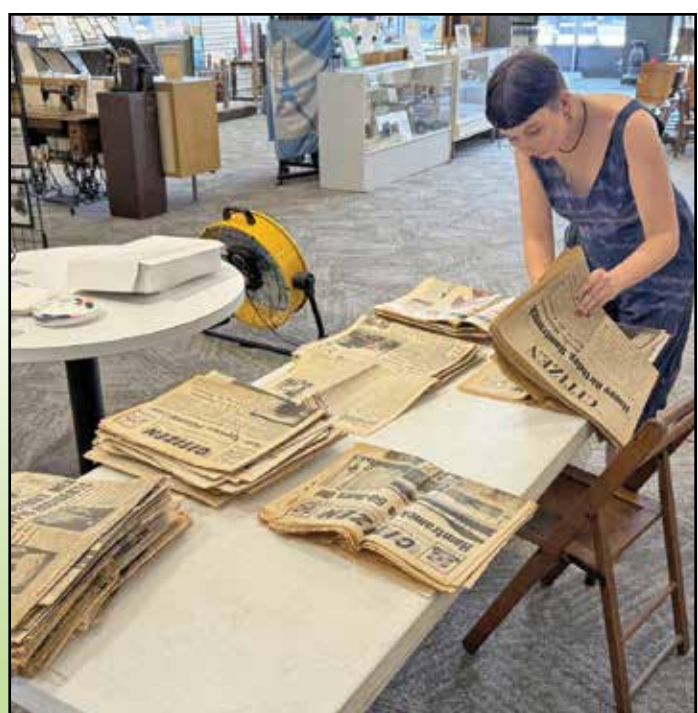
The Hamtramck Historical Museum has been busy cataloguing its collection of newspapers.