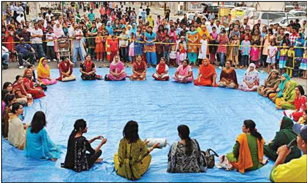
A retired Hamtramck officer says the Department of Homeland Security is seeking people with law enforcement experience to patrol in Hamtramck, presumably to focus on illegal immigrants. Hamtramck has long been an immigrant destination.

The immigrant crackdown by ICE, which is under the auspices of the