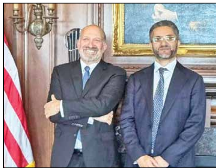
Mayor Amer Ghalib poses with U.S. Secretary of Commerce Howard Lutnick during a meeting they recently had in the White House.

Recently, Israel Prime Minister Benjamin Netanyahu bombed a suspected Hamas headquarters in Qatar, and he is now threatening further military expansion in the Middle East.