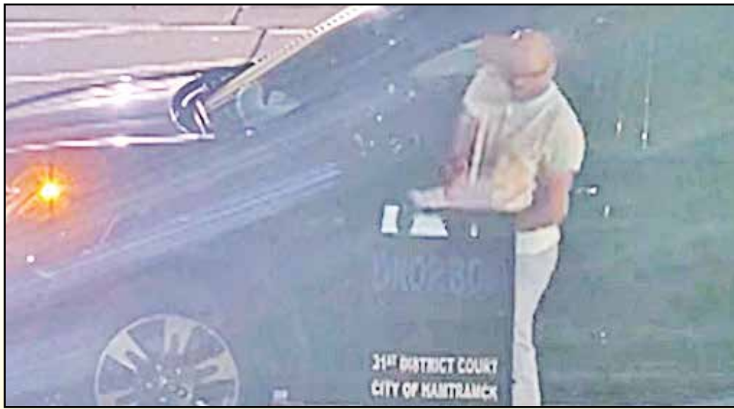
A city hall surveillance camera recording captured several people who were dropping off handfuls of absentee ballots before the August Primary Election. No one has been charged with violating election law, but the state police are reportedly investigating the matter.

When we asked about a prior surveillance