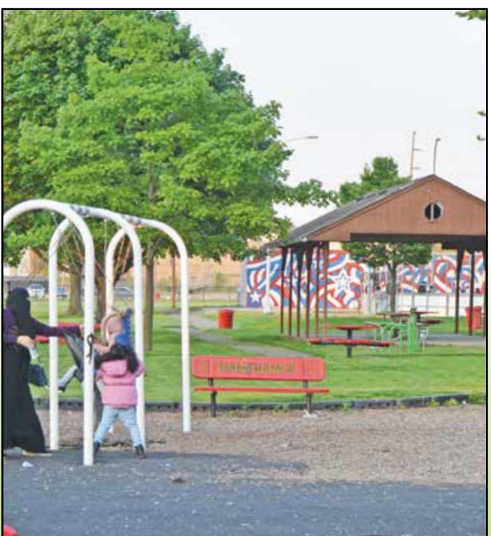
Undercover police officers will be on the lookout for people who litter in Veterans Park. Those who are caught littering could face paying a $500 fine.