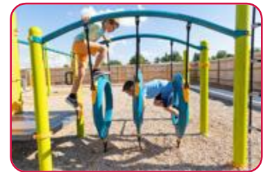
O-Zone® 3-Ring Climber w/Permalene® Handholds