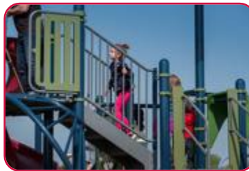
Deck Link w/Steel Barriers