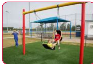
Friendship® Swing w/Single Post Swing Frame 52" Bury