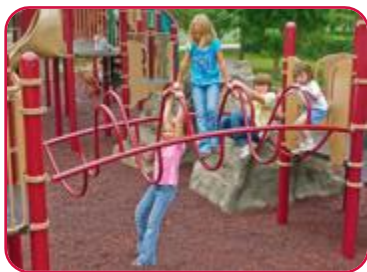
Ring Tangle® Climber w/Handhold Panels