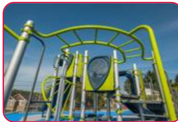
90° Horizontal Ladder