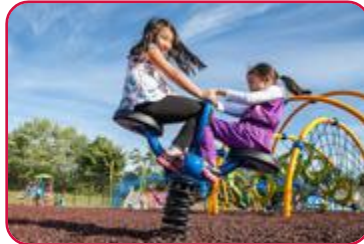
Bobble Rider™, Double