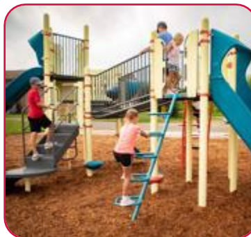
Square Loop Incline Climber w/Permalene® Handholds