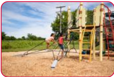
Zenith® Climber w/Permalene® Handholds