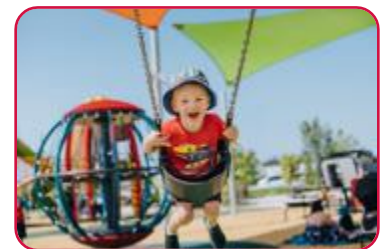
Full Bucket Seat w/Chains

Models shown include standard play products only.