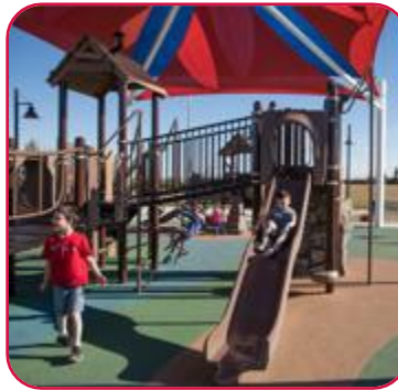
Single Wave Slide