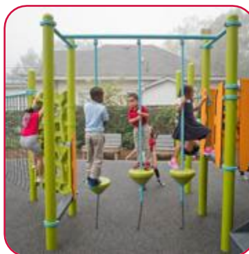
Disc Challenge (84") w/Handhold Panels