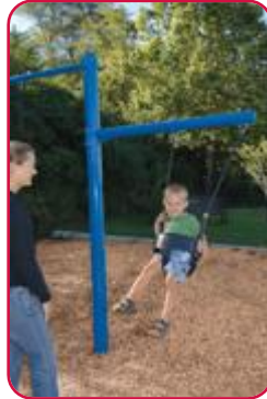
Toddler Swing Add-On Beam