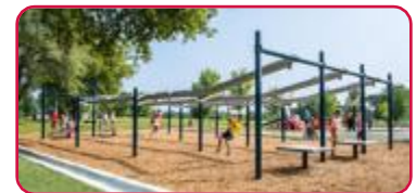
ZipKrooz® Assisted Additional Bay