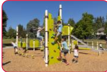
Vertical Ascent® Climber