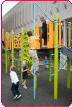
Firepole w/Permalene® Handholds