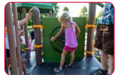
Rain Sound Wheel Panel™

Models shown include standard play products only.