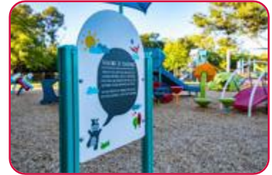
DigiFuse® Arched Sign Panel w/PS Posts

Models shown include standard play products only.