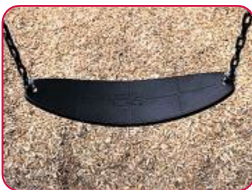
Belt Seat w/Chains