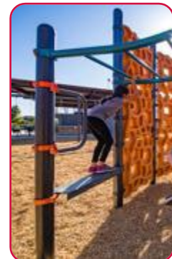
Access/Landing Assembly Seat