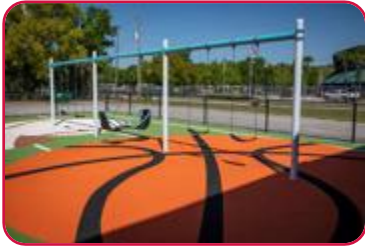
Single Post Swing Frame 52" Bury Additional Bay