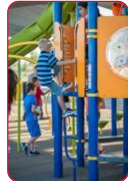
Vertical Ladder w/Permalene® Handholds