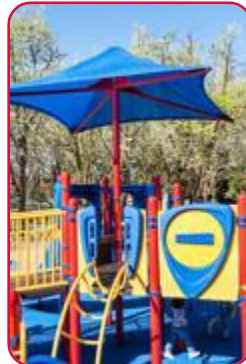
CoolToppers® Single Post Pyramid Roof