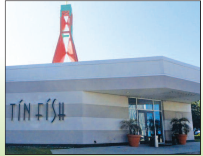
Two women say they were assaulted at The Tin Fish bar in St. Claire Shores last year while off-duty Hamtramck officers stood by and let friends of theirs commit the beatings.