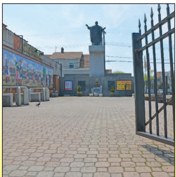
Groundbreaking events will be held next week and the week after to kick off major renovations to all three of the city's parks, including Pope Park (above).