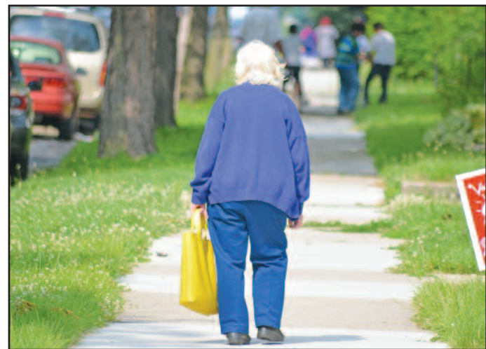
A recent report gave Hamtramck high marks for being a walkable community.