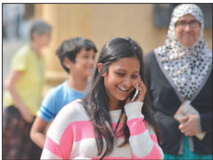
If you talk on your cell phone as you walk through town, be on the lookout for someone coming up to you and swiping your phone.

In some cases there are groups of thieves coordinating the thefts and in other cases it's just a matter of an individual