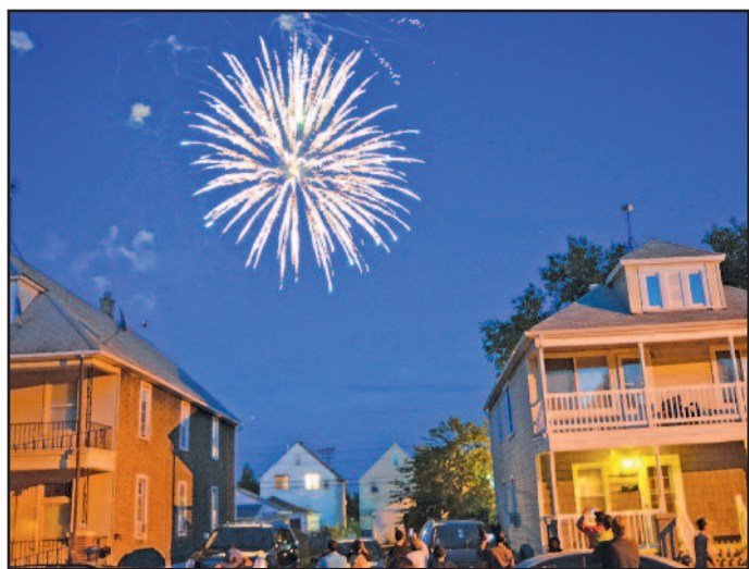
Fireworks will return later this month in Hamtramck, on July 25 at Keyworth Stadium, thanks to the public school district's Recreation Department.

rector of the Department, said he chose to hold it later in the month to give residents a little extra bang since there are so many other com-