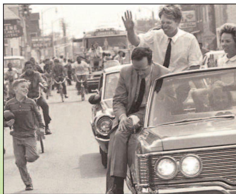
Bobby Kennedy rides down Jos. Campau on May 15, 1968.