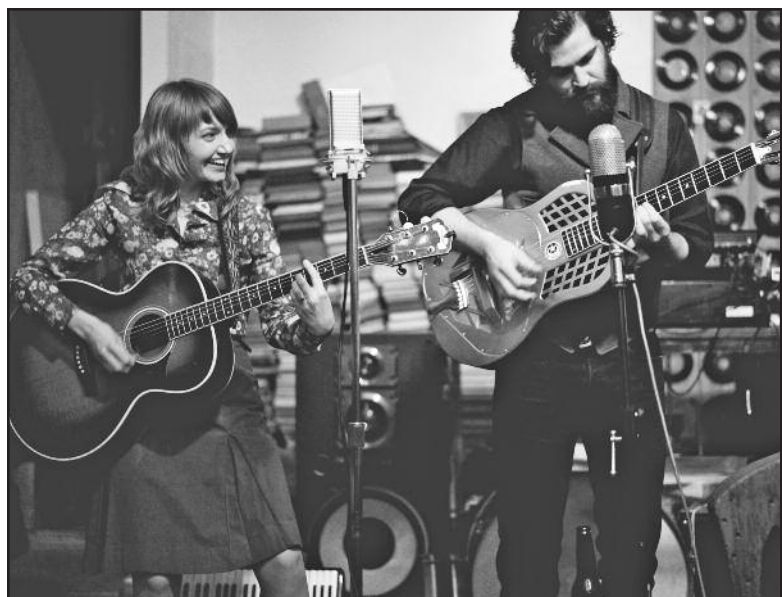
There will be plenty of live music this Saturday during the Porous Borders Festival happening along Carpenter.

the focal points for music at the festival.