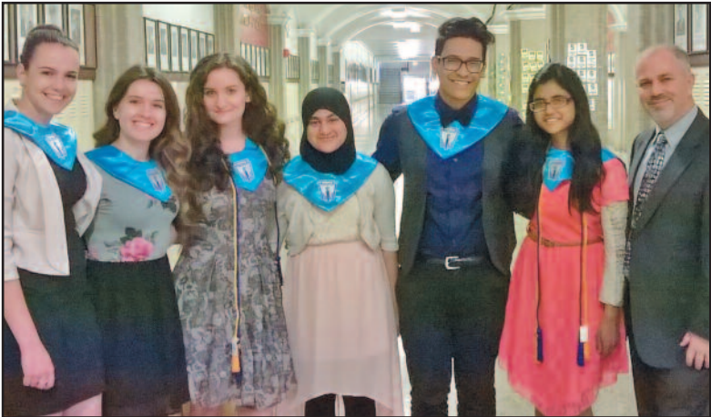
The National Honor Society at Hamtramck High School recently inducted new members.