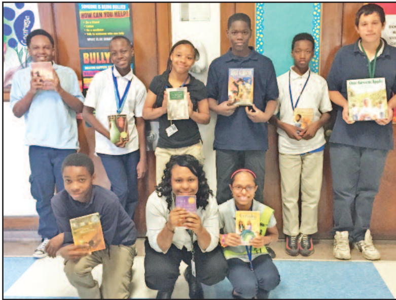
Kosciuszko Middle School recently hosted an english Language Arts program.

Here at KMS, we are committed to helping our students become life-long readers and we are excited to share that same commitment with our parents. Please make sure to join us for our next parent curriculum night this Tuesday, May 19, from 4 to 6 p.m. Our focus will be on learning how to use the data from the NWEA test that your child took to gain a better understanding of their growth over the school year and how to help them con-