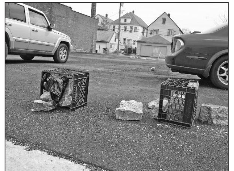
The owner of a lot on Holbrook found out the hard way about trusting a contractor to get city-required permits.