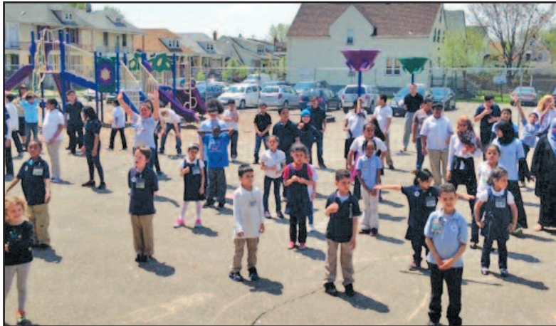
Dickinson East Elementary students learn a lesson about the importance of physical fitness.