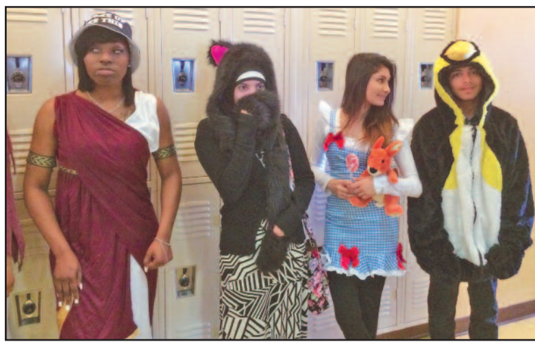
Horizon High School students performed sketches during a recent "Night of Shining Stars."