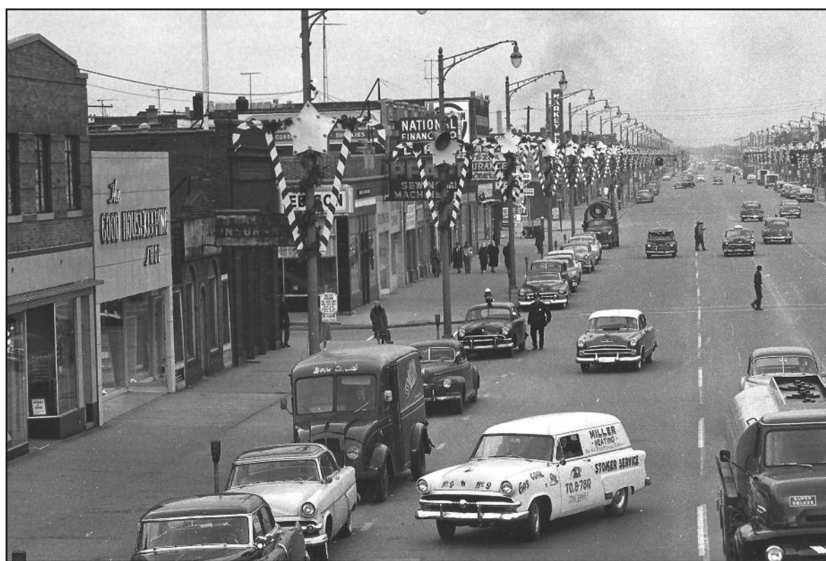
Jos. Campau at just about the time that Northland opened.

Hamtramck has lagged behind for a variety of reasons, including the shifting demographics of the city and the old parking problem. Today, Johnson might say that Jos. Campau needs to redefine itself, to find the proper match of stores to the com-