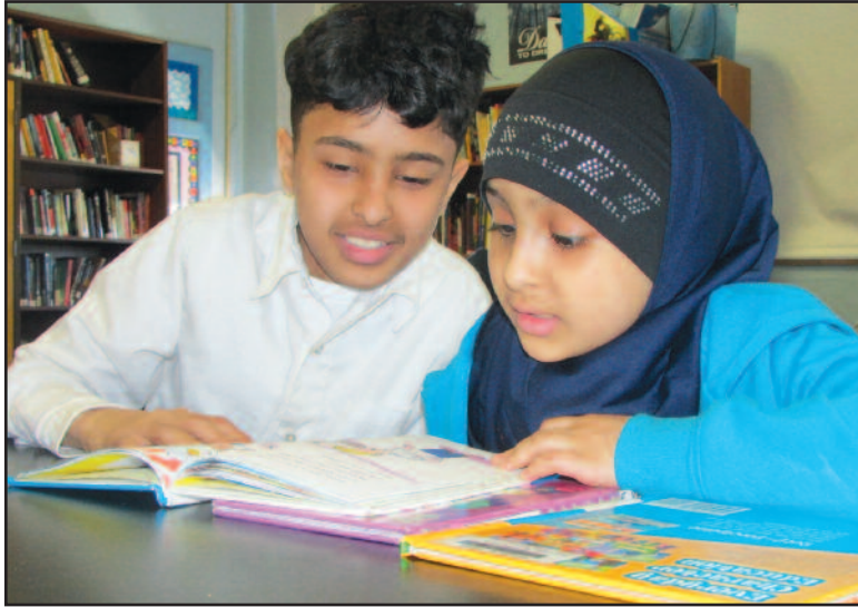
The month of March was reading month at Holbrook Elementary School.

Our guest reader was only going to read to kindergarten to 5th grade, but this time the guest reader wanted to read to the middle school kids. We had a great