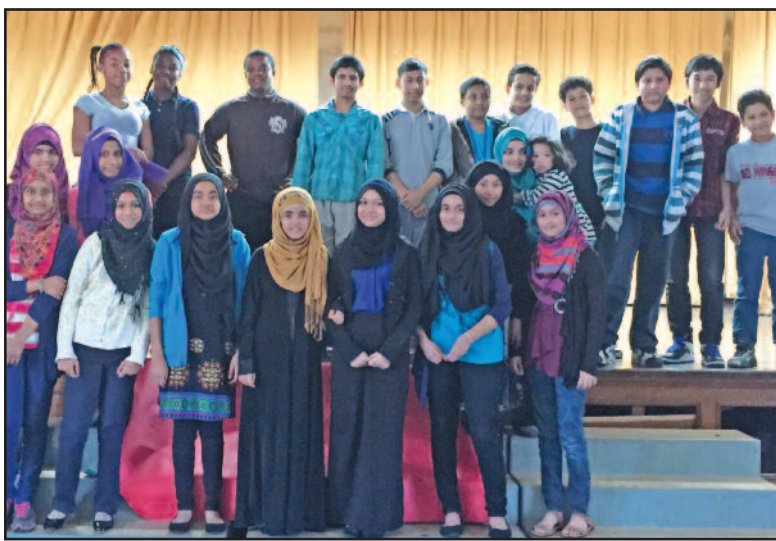
Kosciuszko Middle School students recently participated in a "Poetry Blast."

We had 23 students in both 7th and 8th grades who participated. Students wrote original poems and performed their spoken word in front of their families and friends or they recited a favorite poem that inspired them.