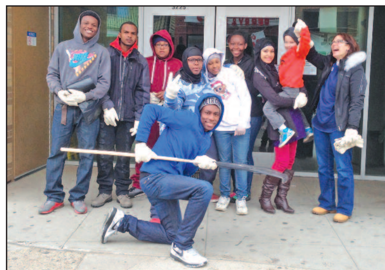
Horizon High School students get into the community spirit during the recent citywide Clean Sweep program.

evidence, Hamtramck High School was victorious and is on its way to the finals on