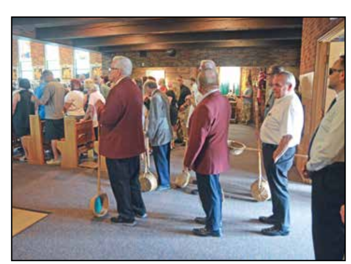
Above and below: Scenes from St. Ladislaus' last Mass on Saturday.