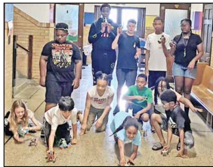
St. Clare of Montefalco Catholic School students recently enjoyed two special summer sessions where they learned about literature and took field trips.

Enroll your children to become Falcons for Fall 2024.