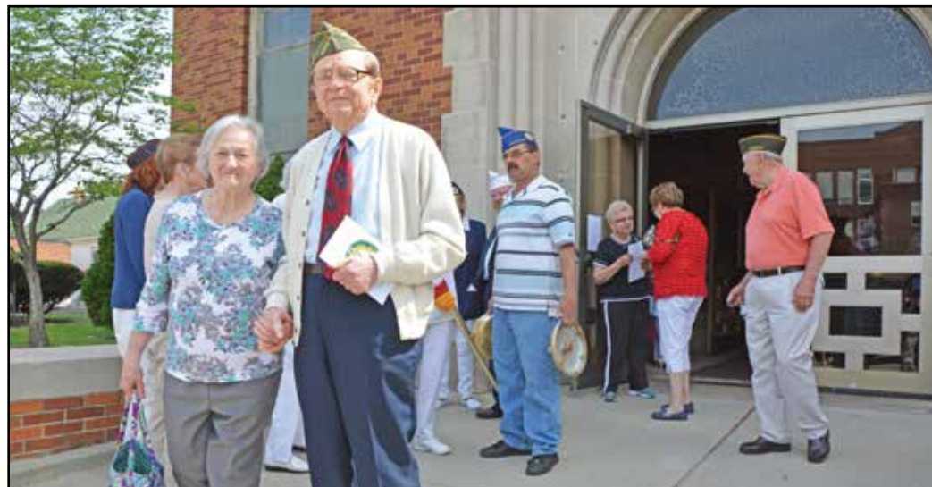
This Saturday will be the last day that a Mass will be held at St. Ladislaus. The parish will be closing its doors for good after Saturday. The parish said the building will be used in the future for secular purposes. This is the first Catholic Church to close in Hamtramck.

One event that made a lasting impression on him was a visit by Pope John Paul II at the church, prior to him being appointed to