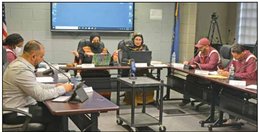
The Hamtramck Public School Board will spend this month talking about the district's budget and millage renewal proposals. Its regular meeting for July has been cancelled.

why it skipped getting the ballot question on the August primary election.