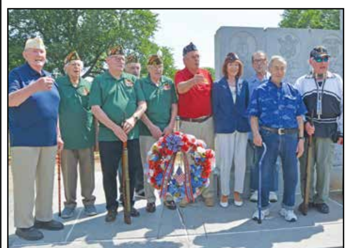
Above and below: Scenes from last Sunday's services in honor of Memorial Day.