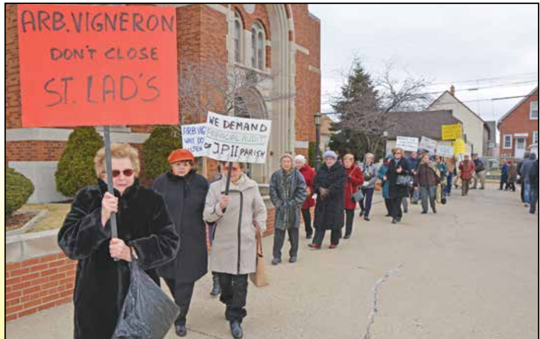
In 2016, St. Ladislaus parishioners protested over a proposal to close the church because there were fewer and fewer parishioners who attended services. Now, however, time has run out. File photo

The plan to close its doors has one more step to go, Pietrzak said: Getting final approval by the Detroit Archdiocese.